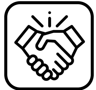
Prevent Any Contact