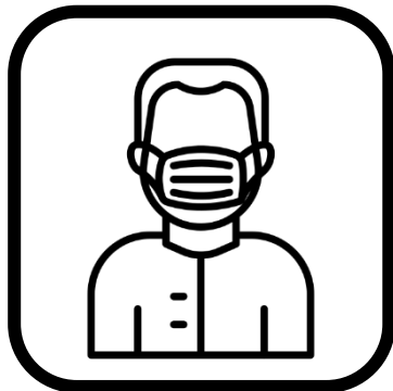
Wear a Mask