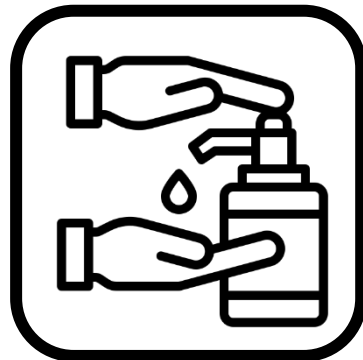
Wash your Hand or Use Hand Sanitizer